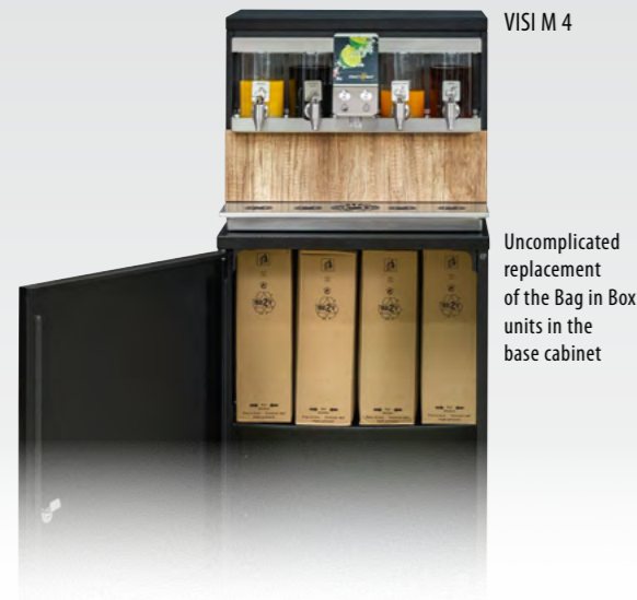
VISI M 4

Uncomplicated replacement of the Bag in Box units in the base cabinet