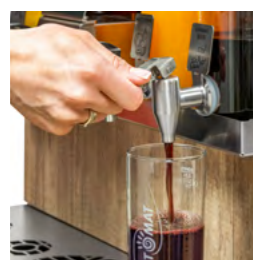
Intelligent drink output