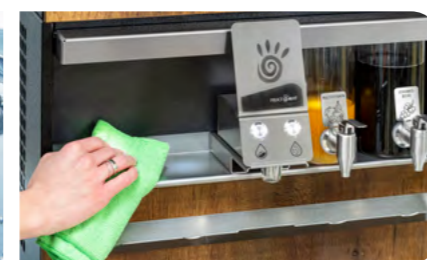
Easy handling cleaning and service