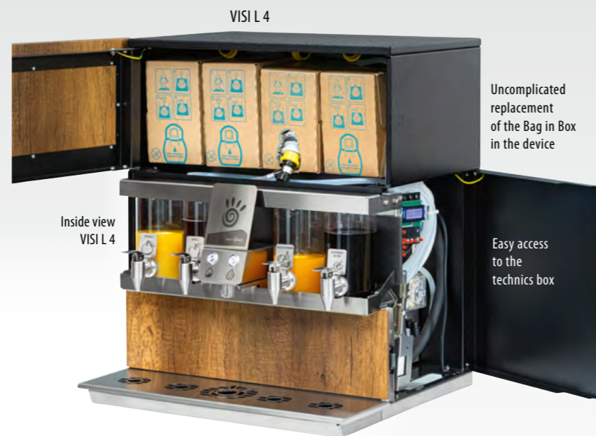
VISI L 4

Uncomplicated replacement of the Bag in Box units in the base cabinet