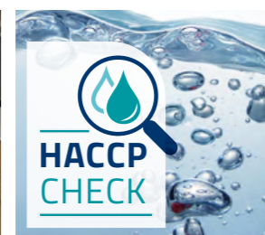
All devices are HACCP approved